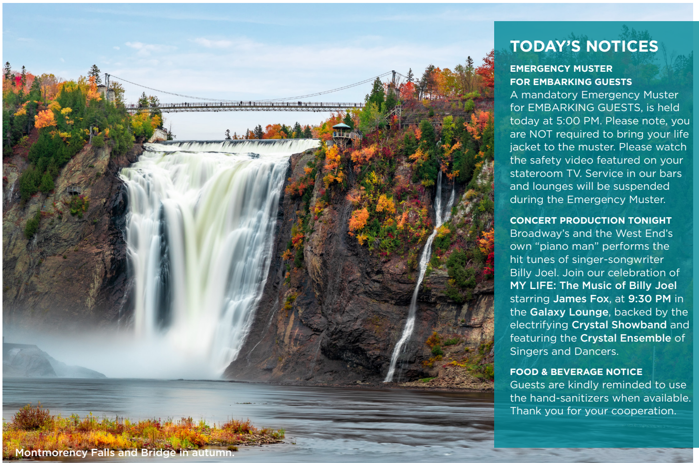
Montmorency Falls and Bridge in autumn.

FOOD & BEVERAGE NOTICE Guests are kindly reminded to use the hand-sanitizers when available. Thank you for your cooperation.